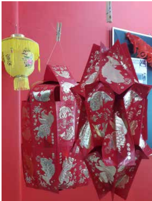
YEAR 12 & YEAR 9