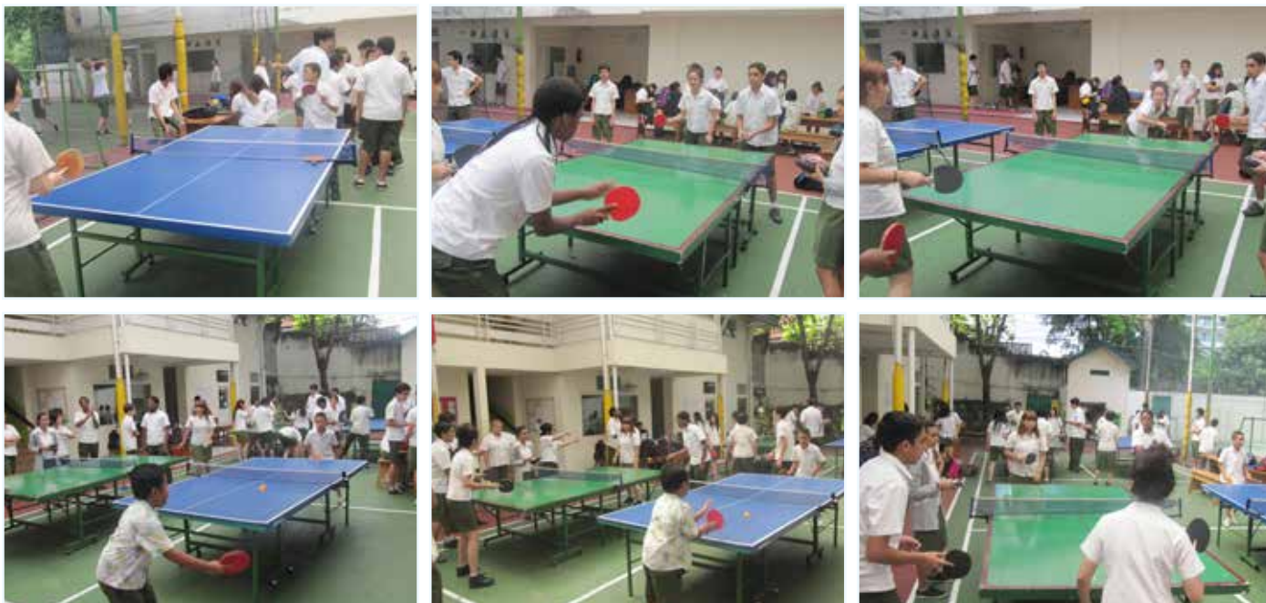
Table Tennis Tournament