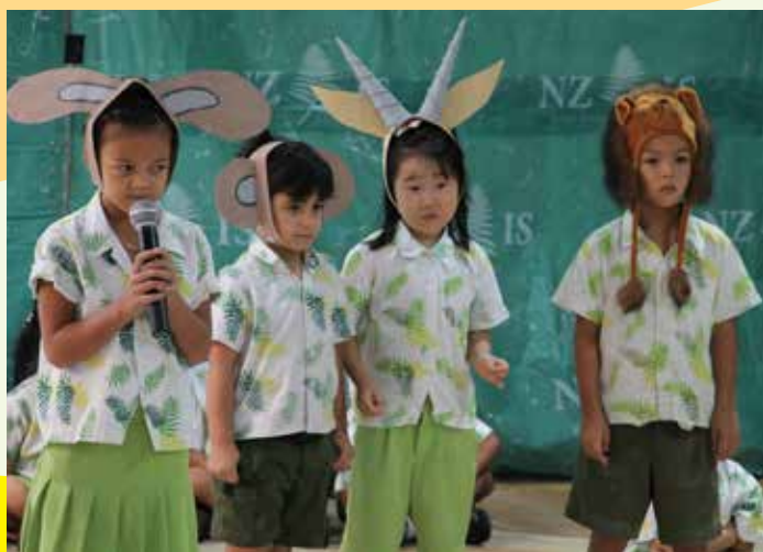
Ika children were practising in their classroom all week for their first assembly!