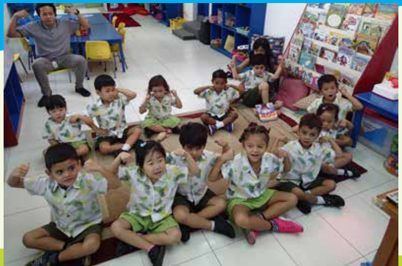
They starred in their own 'Ika friends' video, then enjoyed watching it! They loved listening to the 'What I am' song by Will.I.am, which ended their assembly!