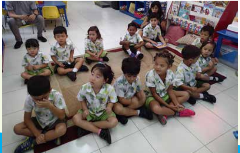
They acted out the 'good to be me' story of the lion, gazelle, monkey and mouse!