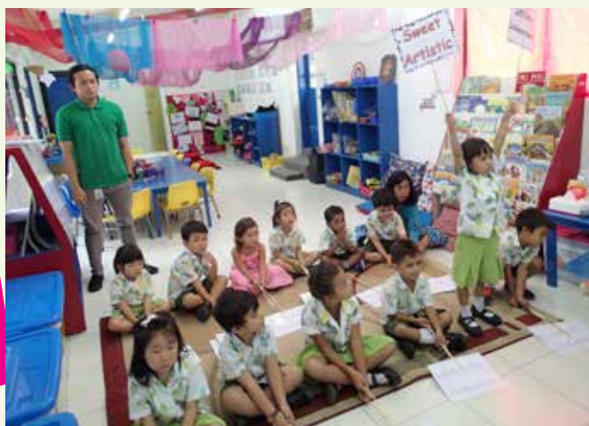
They practised singing the New Zealand National anthem in both Maori and English!