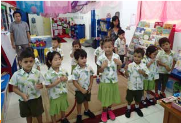
They recited the poem, 'I am me' together.