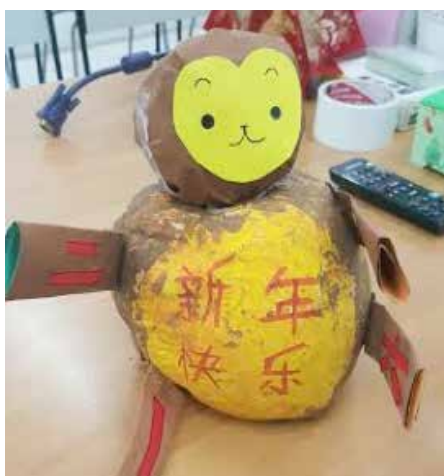
EunHoo Year 8