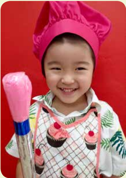
Owner of a doughnut shop