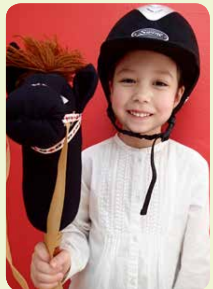
Horse riding champion