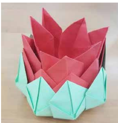
Hyungwon Year 8