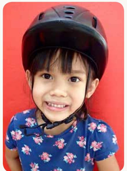
Horse riding champion